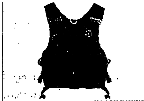
[mouse over large image to zoom]

The Mustang Survival Operations Support Water Rescue Vest delivers a more compact, light weight solution for rescue vests, while still providing 18.8lbs of buoyancy to the wearer. This bright orange and black vest with reflective tape on the front and back is easily visible in and around the water, while the Fast Tab on the front chest acts as an easy attachment point for accessories such as knives, scissors or strobe lights. With a comfortable fit, the Mustang Survival Operations Support Water Rescue Vest is excellent for continuous wear.