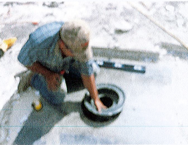
New Roof Drain Installation (3 of 3)