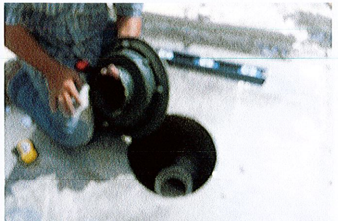
Install Metal Plate (4 of 4)