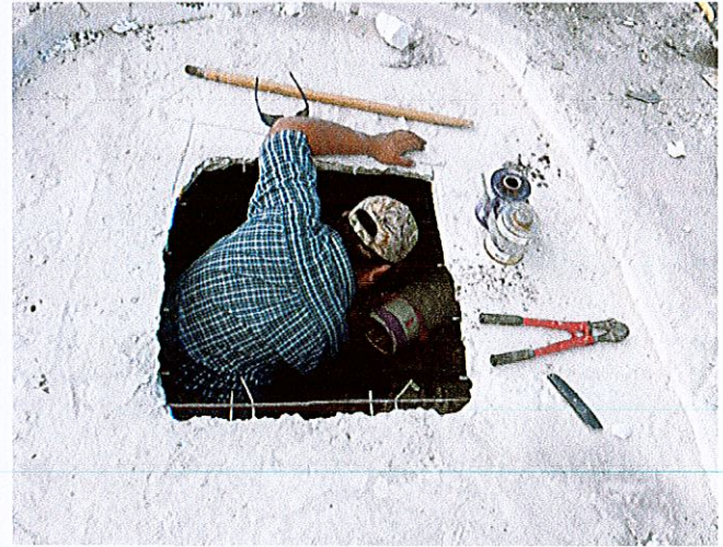
Break Solid Concrete Roof to Install New Drains