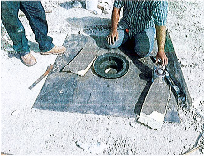
Install Metal Plate (1 of 4)