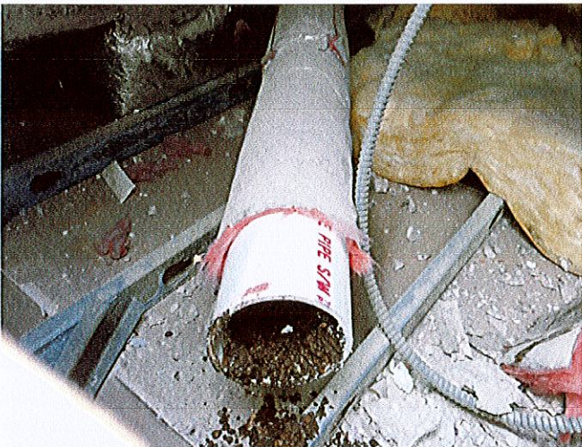
Clean Roof Drains: Clogged PVC Lines (3 of 4)