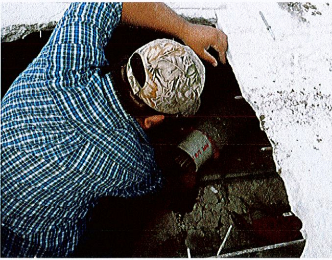
Clean Roof Drains: Clogged PVC Lines (1 of 4)