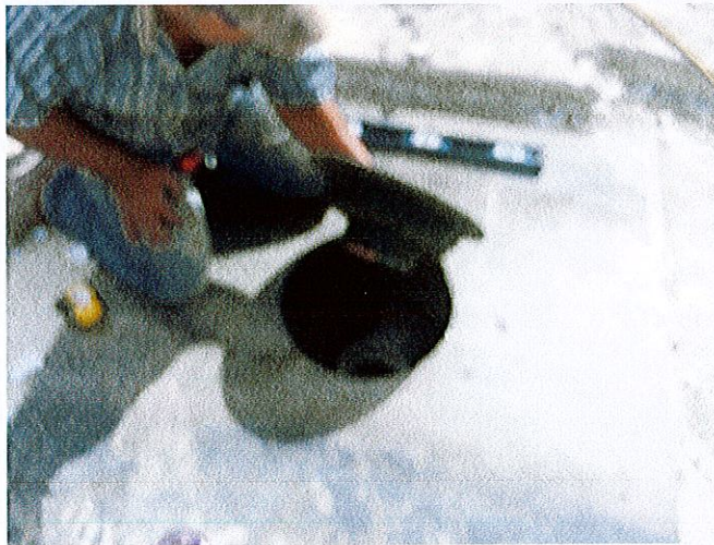
Install Metal Plate (3 of 4)