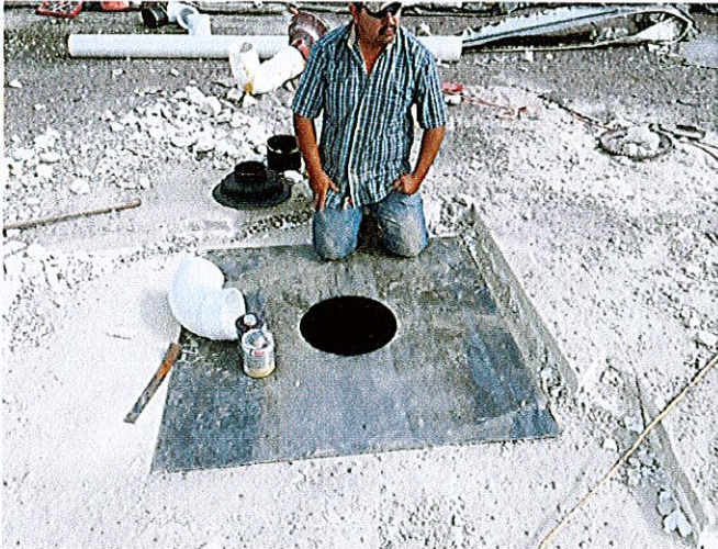
Attach New Tubing for Roof Drains (1 of 5)