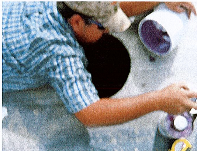
Attach New Tubing for Roof Drains (5 of 5)