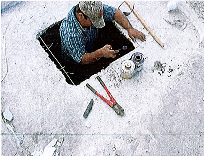
Break Concrete Roof