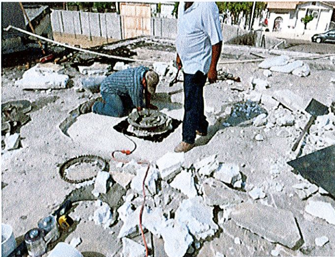
Break & Remove Roof Drain

Project: Webb County Juvenile Detention Center Address: 4101 Juarez Ave. Laredo, TX 78041 Change Order No. 2