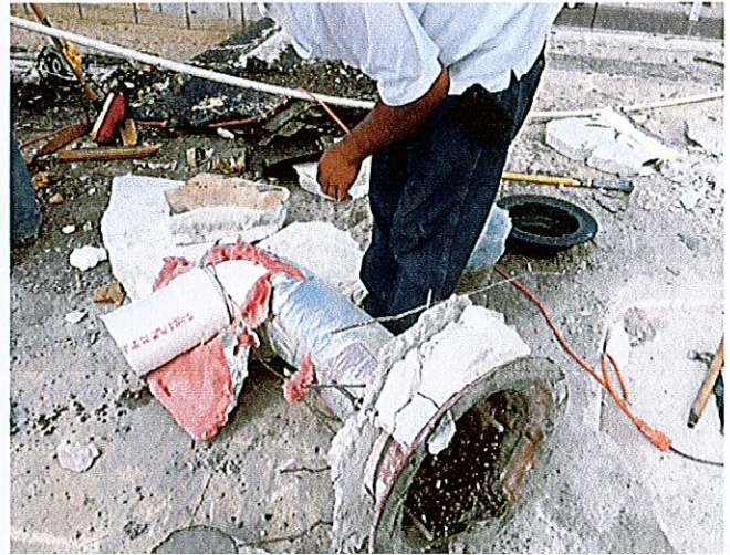
Remove Roof Drain & Old Connections