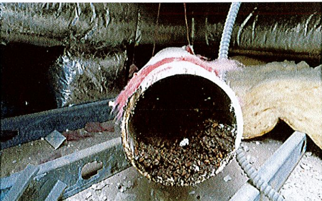
Clean Roof Drains: Clogged PVC Lines (4 of 4)