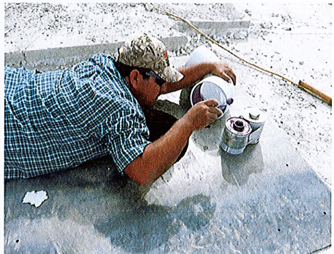
Attach New Tubing for Roof Drains (4 of 5)