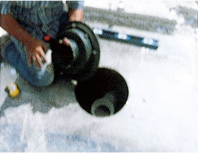
New Roof Drain Installation (1 of 3)