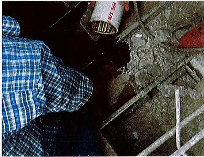
Clean Roof Drains: Clogged PVC Lines (2 of 4)