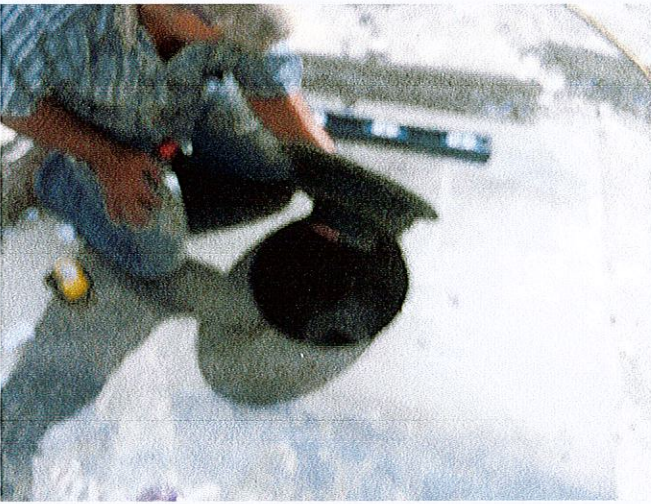
New Roof Drain Installation (2 of 3)