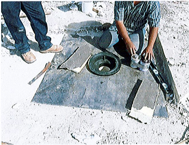
Install Metal Plate (2 of 4)