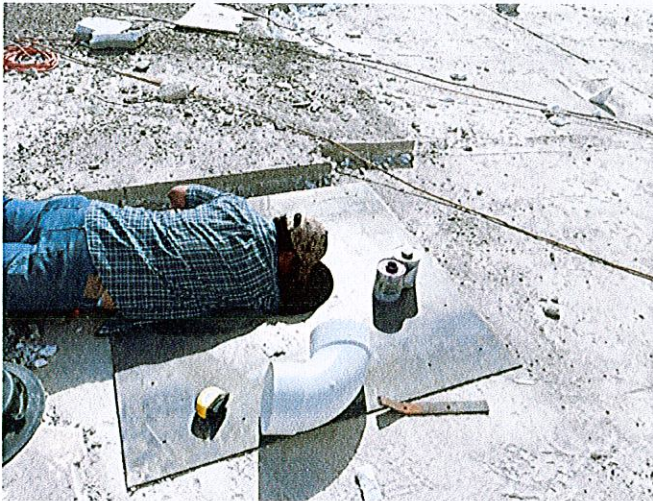
Attach New Tubing for Roof Drains (3 of 5)