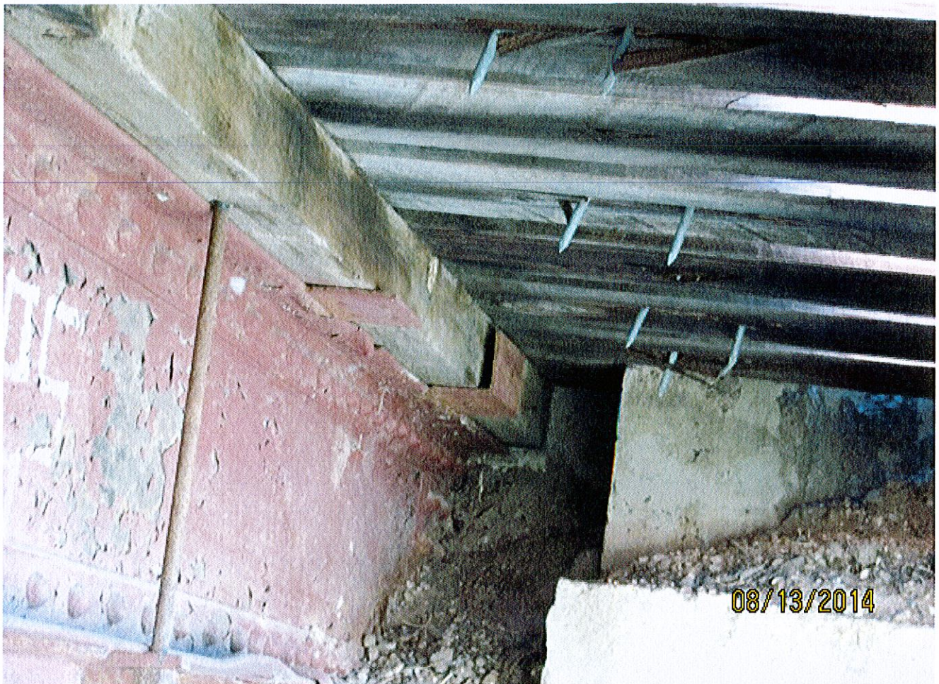
Lincoln Road Bridge 17.3 mi north of US 59