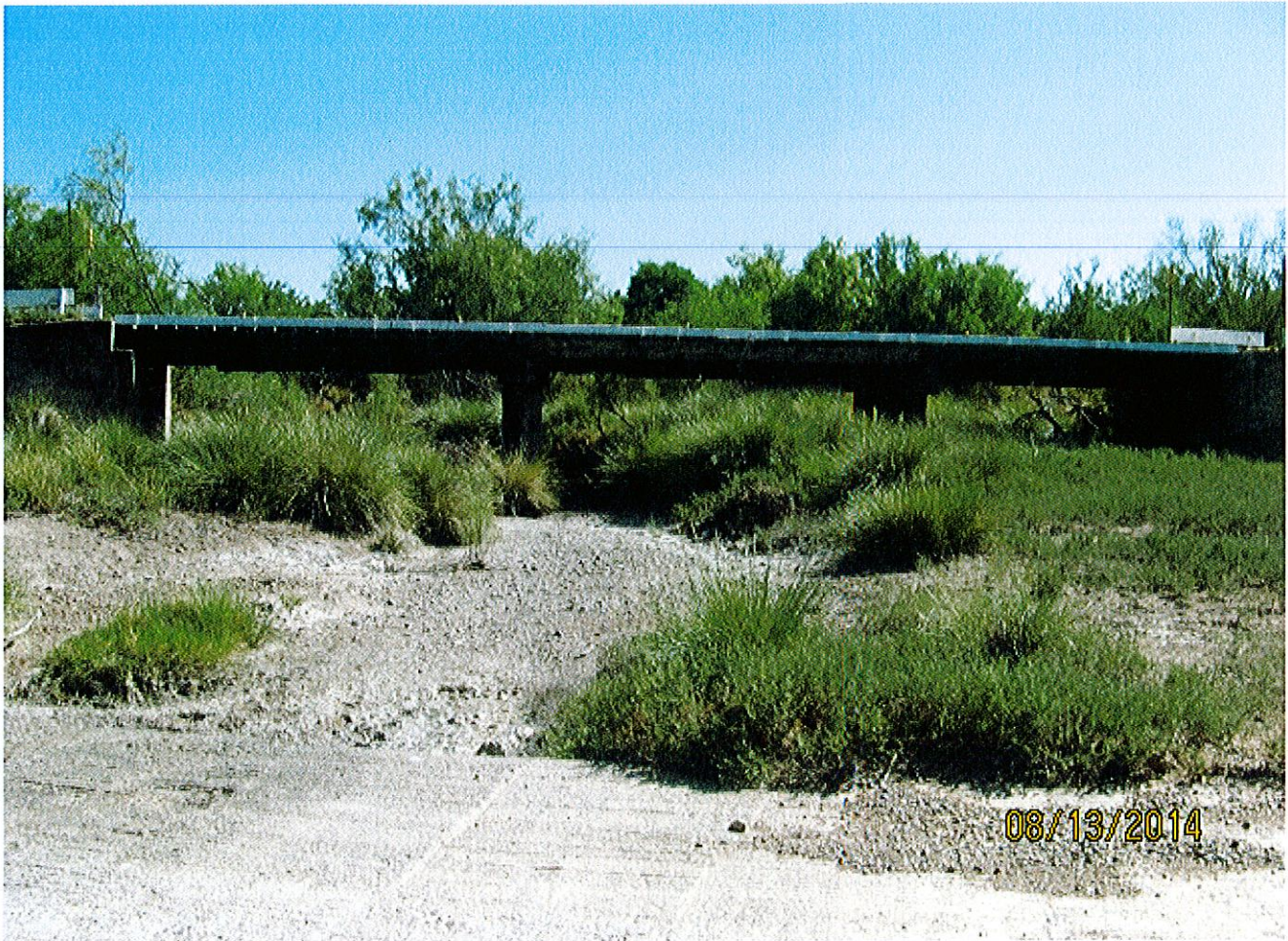
Lincoln Road Bridge 17.3 mi north of US 59

Lincoln Road Bridge Lat. 90°8'16.784"W Long. 27°50'51.982"N Length: 68' Width: 12'