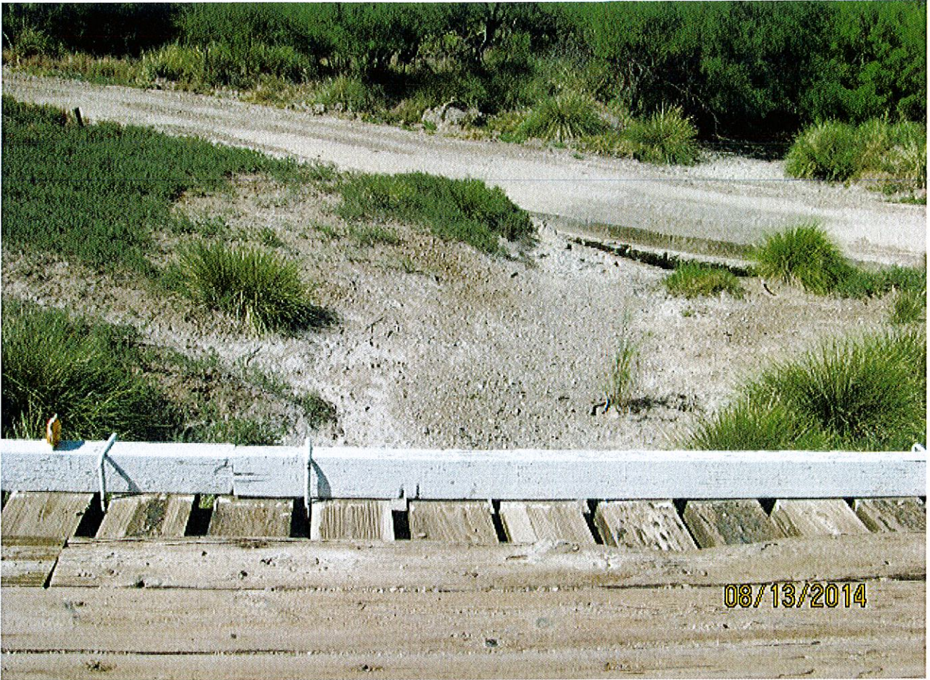
Lincoln Road Bridge 17.3 mi north of US 59