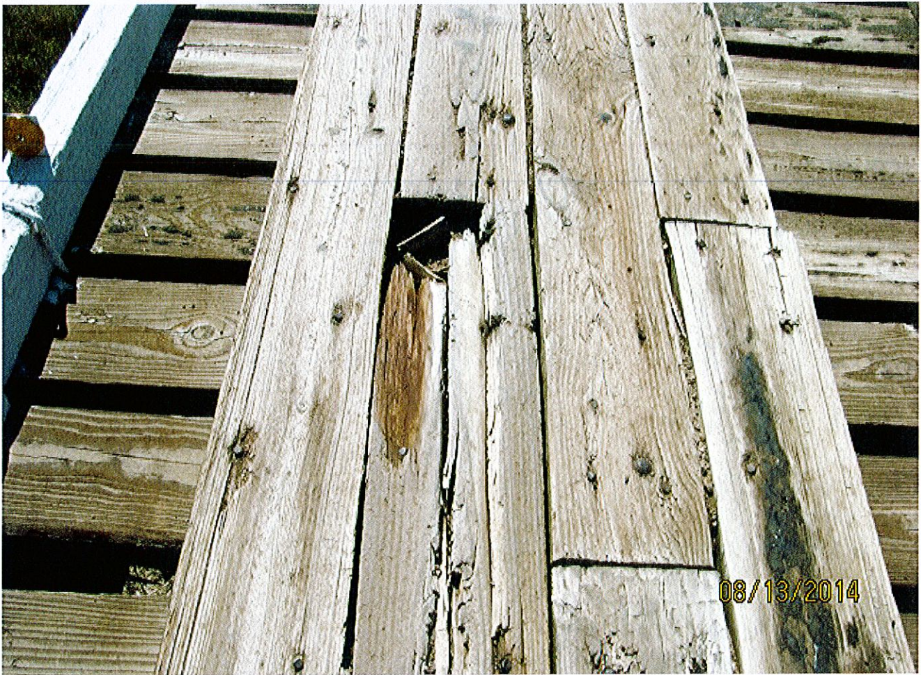
Lincoln Road Bridge 17.3 mi north of US 59