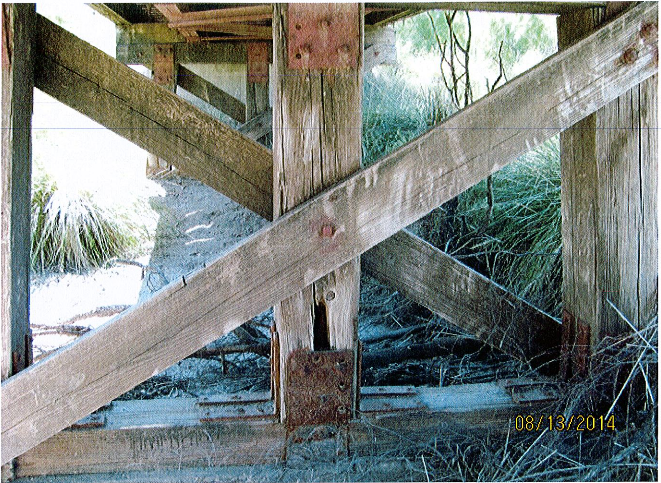
Lincoln Road Bridge 17.3 mi north of US 59