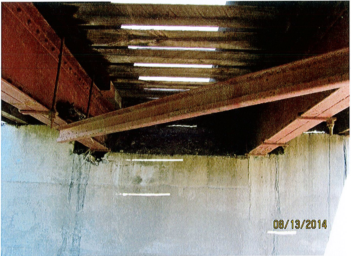
Lincoln Road Bridge 17.3 mi north of US 59