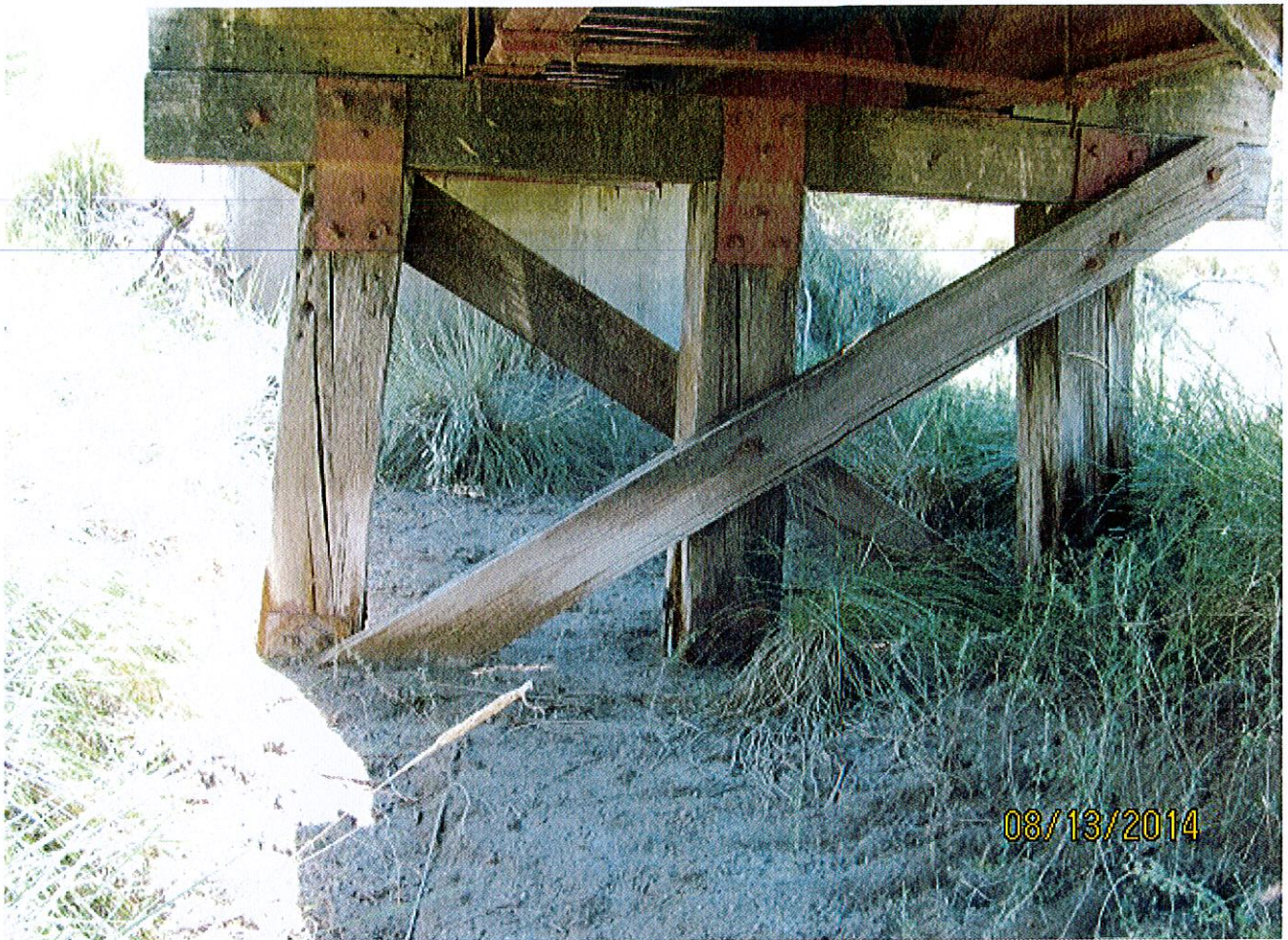
Lincoln Road Bridge 17.3 mi north of US 59