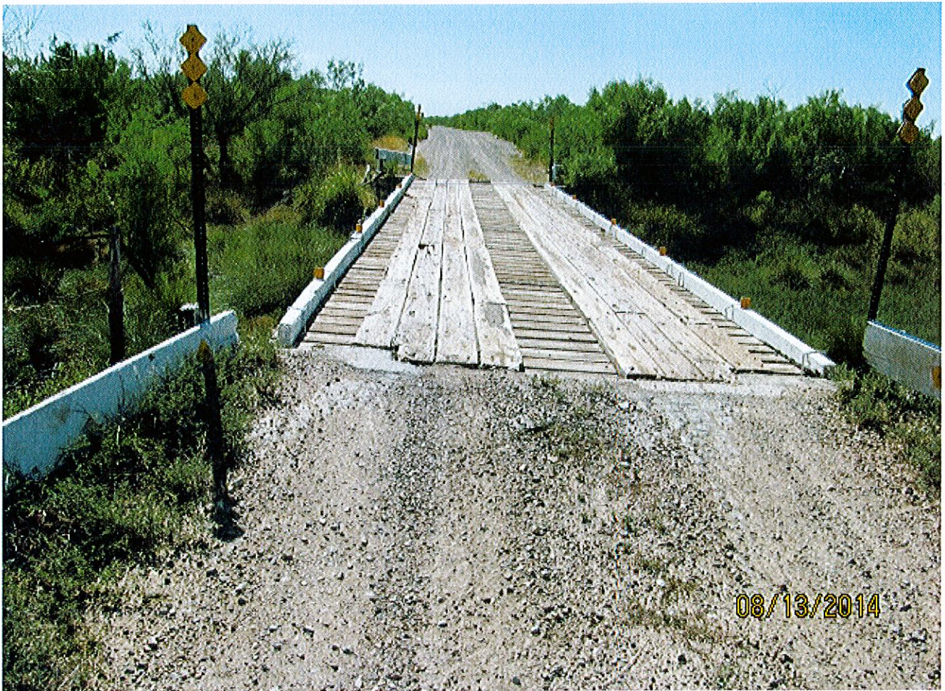
Lincoln Road Bridge 17.3 mi north of US 59