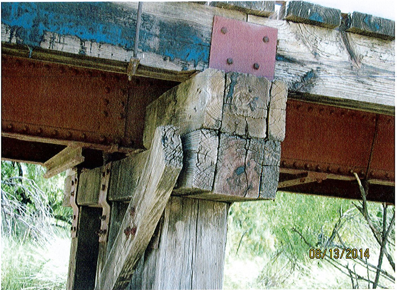
Lincoln Road Bridge 17.3 mi north of US 59