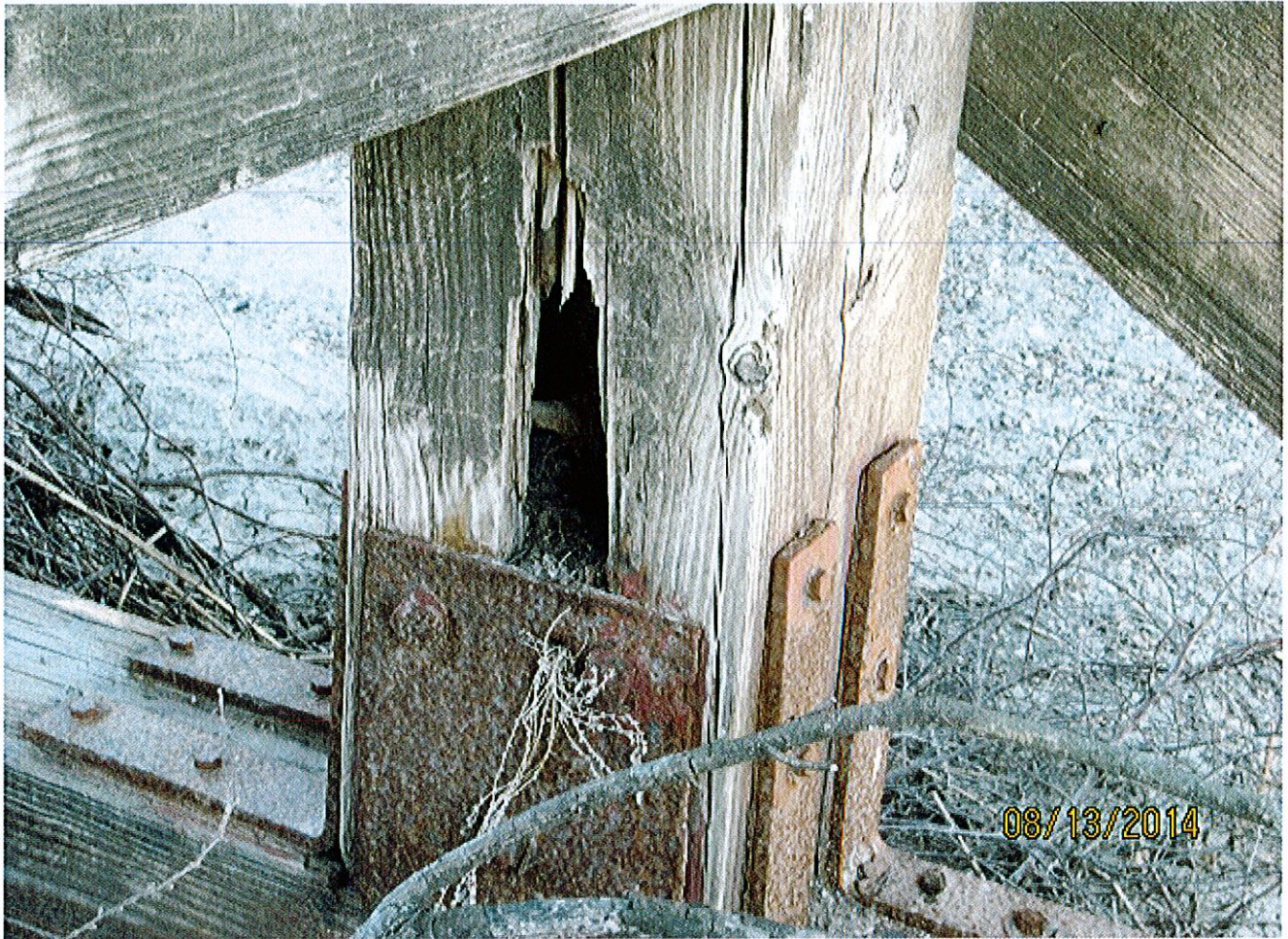
Lincoln Road Bridge 17.3 mi north of US 59