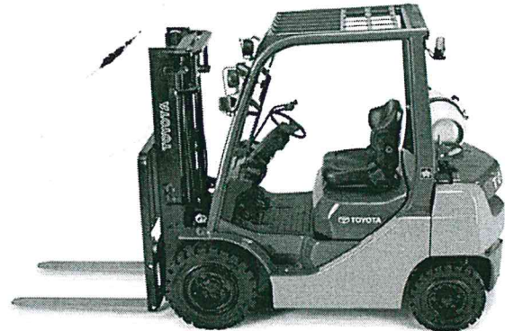
Photo may portray optional equipment not included in your quotation.