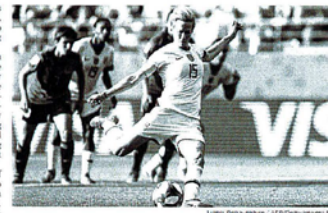
Megan Rapinoe told a reporter that she would not go to the White House if the United States wins the Women's World Cup. That tweet led President Donald Trump criticizing her in a three-tweet blast Wednesday morning.

Trump said Rapinoe "should never disrespect our country, the White House or our flag." "I am a big fan of the American Team, and Women's Soccer, but Megan should WIN first before she TELLS French the job!" Trump wrote, and then said he would invite the team to the White House on Friday in a bid to advance to the semifinals. He made a range of comments — including one in which he told Rapinoe to "hard over my heart, I probably never sing the national anthem again."