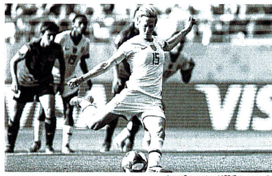
Megan Rapinoe told a reporter that she would not go to the White House if the United States wins the Women's World Cup. That resulted in President Donald Trump criticizing her in a three-tweet blast Wednesday morning.

after a video of Rapinoe's interview went viral. In it, she used an obscenity to dismiss the idea of visiting the White House. Rapinoe, 33, has been an outspoken critic of the president and caused a stir in 2016 when she became one of the few white players to join Colin Kaepernick and others when they were leading an ongoing protest against racism and police violence by kneeling for the national anthem at sporting events. Rapinoe, a co-captain of the team, is also a party to its gender discrimination lawsuit against U.S. Soccer. She is gay and is an outspoken supporter of LGBT rights. U.S. Soccer rewrote its rules for national team players after Rapinoe's kneeling protest and now requires players to stand respectfully for the anthem ever since. In May, Rapinoe chose not to contest the new rule and has stood silently for the anthem ever since. In May, Rapinoe told Yahoo Sports "I'll probably never put my hand over my heart, I'll probably never sing the national anthem again."