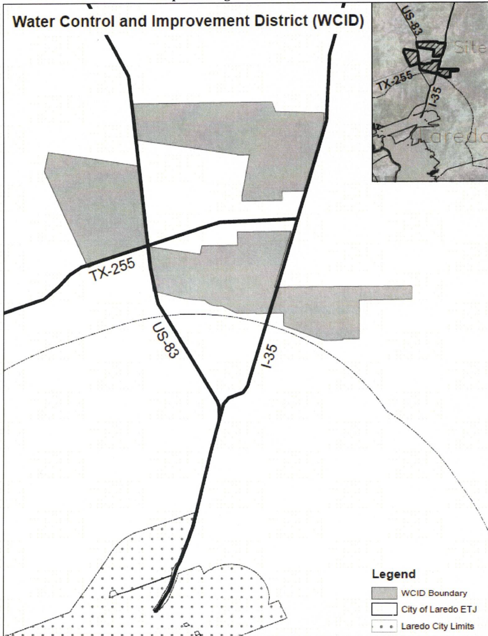
Map Showing District Boundaries

RECORDER'S MEMORANDUM: ALL OR PARTS OF THE TEXT ON THIS PAGE WAS NOT CLEARLY LEGIBLE FOR SATISFACTORY RECORDATION.