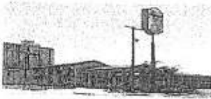
Super 8 Laredo

Dates: Wed, Jun 25, 2014 - Fri, Jun 27, 2014 Nights: 2 Room: 1 Traveler: 1