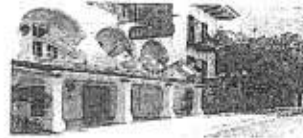
La Posada Hotel