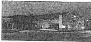
Homewood Suites by Hilton Laredo at M...