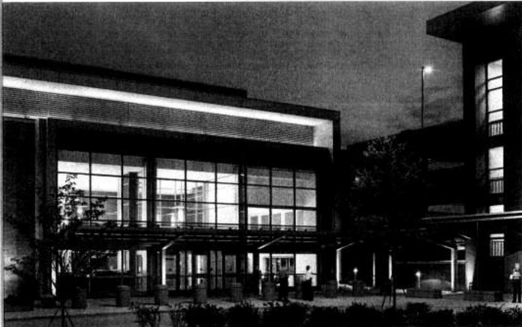
Cover: U.S. Federal Courthouse, Laredo, Texas; Denton County Law Enforcement Master Plan, Denton, Texas Above: Wake County Jail Phase 2, Raleigh, North Carolina