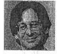
Alfie Kohn Author, Lecturer on Education, Parenting and Human Behavior LAS VEGAS