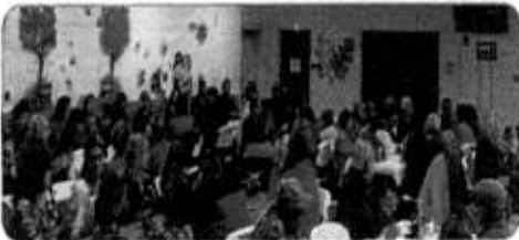
Bruni Center Events, Easter, Christmas, Thanksgiving

Halloween Costume Contest Thanksgiving Elderly Luncheon