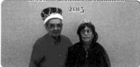
Elderly Valentine Coronation