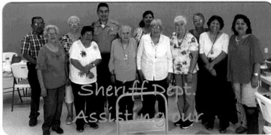
Sheriff Dept. Assisting our Bruni elderly!