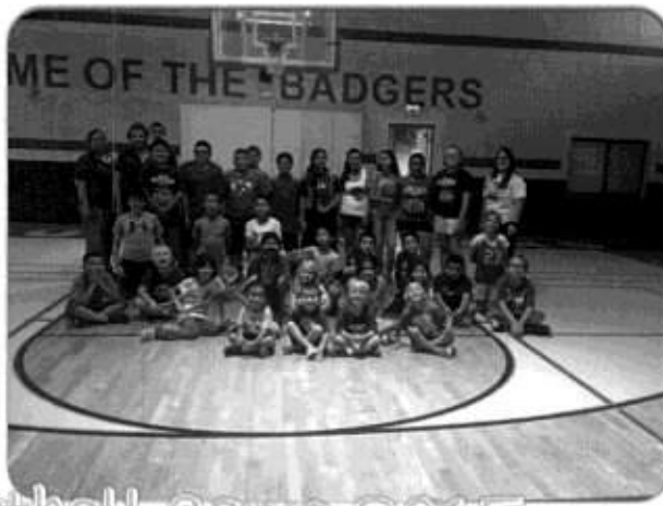
Basketball Camp 2015