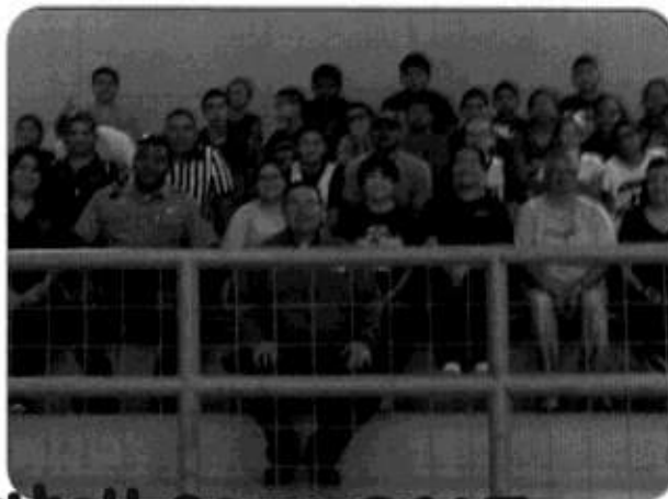
Basketball Camp 2015