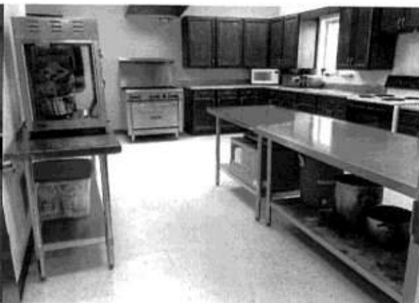
New kitchen addition