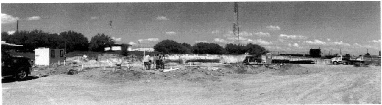
Construction of Central Fire Station on Henry Cuellar Rd. at HWY 59