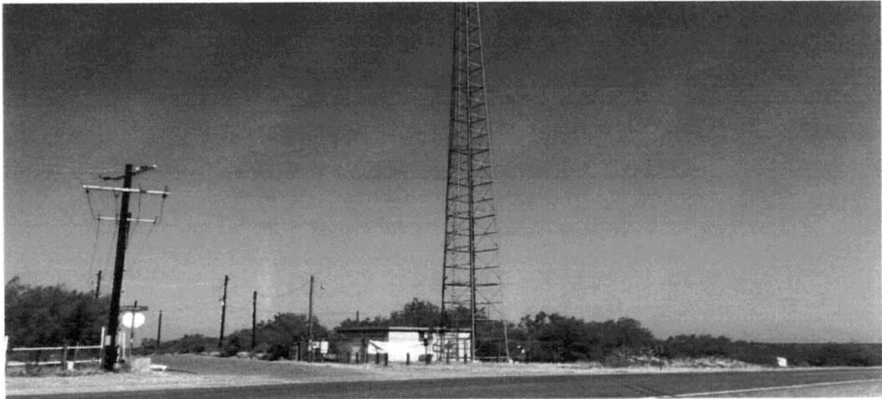
Future Site of Los Botines Fire Station – at the intersection of HWY 83 N. & San Juan Rd.