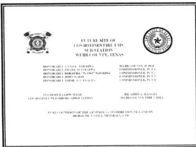
Proposed signage for Botines Fire Station Construction Site