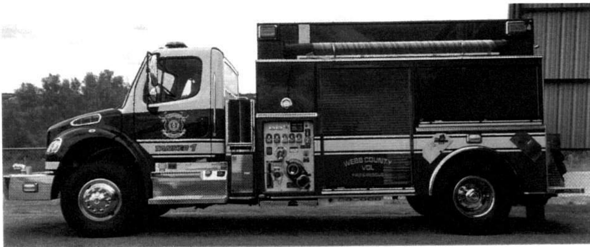
Ferrara (2000 gal.) tanker - Purchased Sept. 2015 with TFS Appropriation funds

Texas Forest Service Appropriation $1.5 million - for the purchase of firefighting equipment to include but not limited to rescue equipment, communications, personal protective gear, and vehicles. Funding concluded March 2016