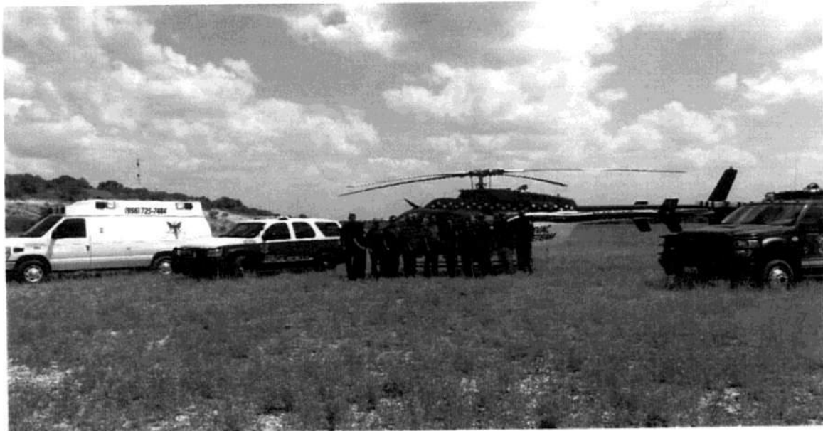
Partnership (Angel Care, Air Evac, & Webb Co. VFD)