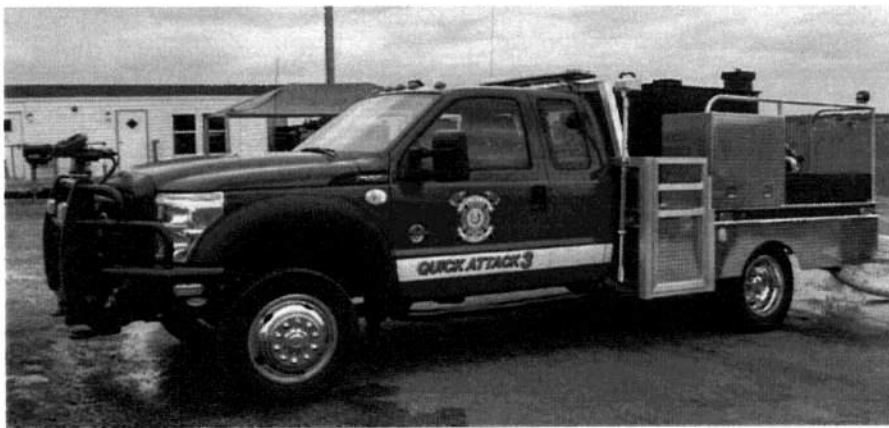
Ford F550 (400 gal.) Quick Attack- Purchased Dec. 2015 with CDBG grant funds

A Quick-Attack unit was delivered January 5 th , 2016. This is a 2016 Ford F550, 4x4, which was purchased for $122,647.15. This unit will serve as a primary response vehicle out of the future Botines fire station.