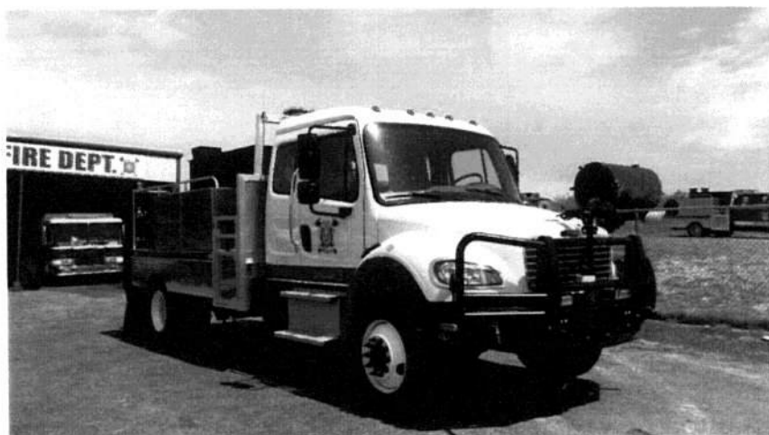
Ford F750 (400 gal.) Brush Truck 3- Purchased Dec. 2015 with CDBG grant funds

A Brush Truck was delivered March 15 th , 2016. This is a 2016 Ford F750, 4x4, which was purchased for $175,112. This unit will respond from the future Botines fire station.