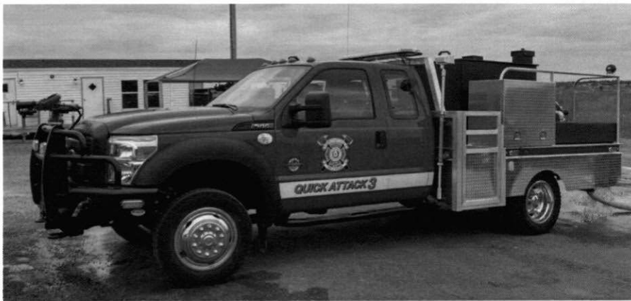
Ford F550 (400 gal.) Quick Attack- Purchased Dec. 2015 with CDBG grant funds

A Quick-Attack unit was delivered January 5 th , 2016. This is a 2016 Ford F550, 4x4, which was purchased for $122,647.15. This unit will serve as a primary response vehicle out of the future Botines fire station.