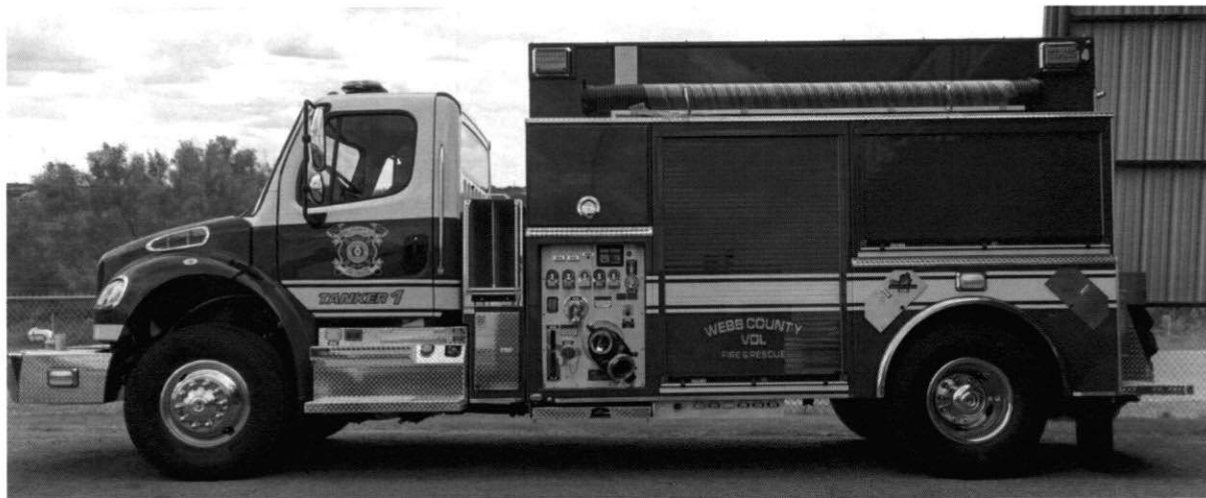
Ferrara (2000 gal.) tanker - Purchased Sept. 2015 with TFS Appropriation funds

Texas Forest Service Appropriation $1.5 million - for the purchase of firefighting equipment to include but not limited to rescue equipment, communications, personal protective gear, and vehicles. Funding concluded March 2016