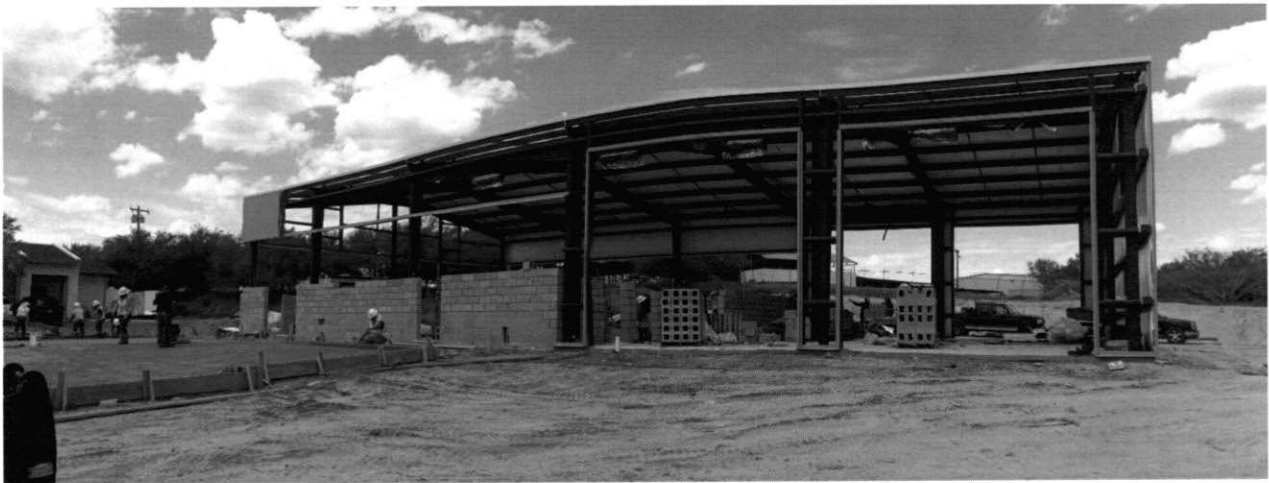
Construction of Central Fire Station on Henry Cuellar Rd. at HWY 59 - June 2016