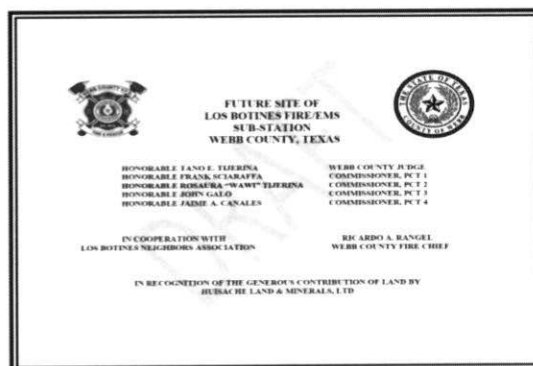
Proposed signage for Botines Fire Station Construction Site