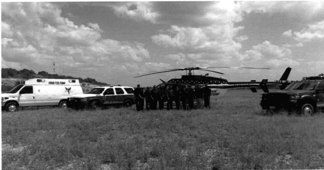
Partnership (Angel Care, Air Evac, & Webb Co. VFD)

Burn permits issued for FY 2015 - 2016= 27