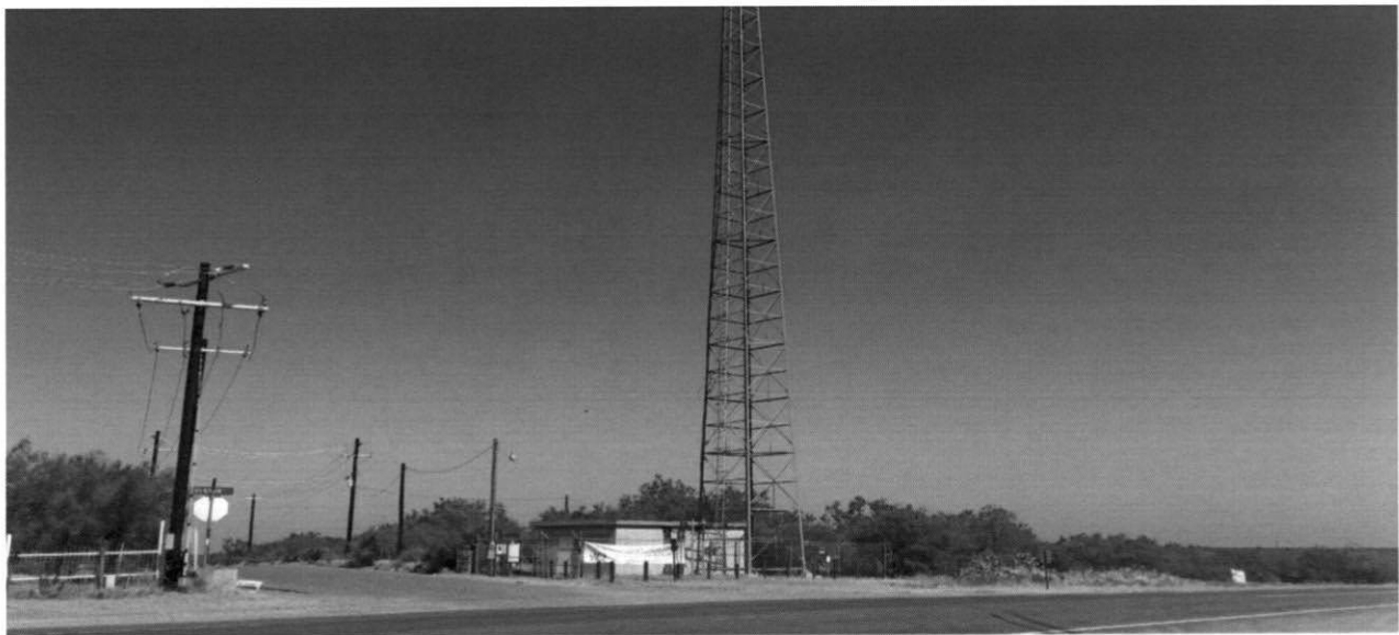
Future Site of Los Botines Fire Station– at the intersection of HWY 83 N. & San Juan Rd.