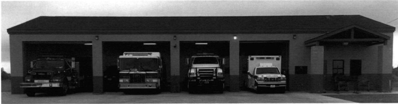
Webb County- Quad City Fire Station - Bruni, TX

Home to the Webb County Ambulance Service. The Quad City Fire Station was built in 2011. This station is manned 24/7 by certified firefighters and staffed with EMS personnel periodically throughout the week. Recently Webb County Fire received a new ambulance to serve the Quad City area, in May 2016. This basic life support unit is utilized to primarily serve the Oilton, Mirando City, Aguilares, and Bruni areas of Eastern Webb County. This purchase was made possible through funds provided by a tax abatement agreement between Webb County and Javelina Wind Energy, in the amount of $150,000.