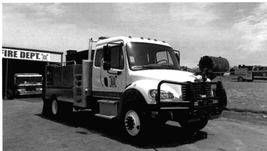
Ford F750 (400 gal.) Brush Truck 3- Purchased Dec. 2015 with CDBG grant funds

A Brush Truck was delivered March 15 th , 2016. This is a 2016 Ford F750, 4x4, which was purchased for $175,112. This unit will respond from the future Botines fire station.