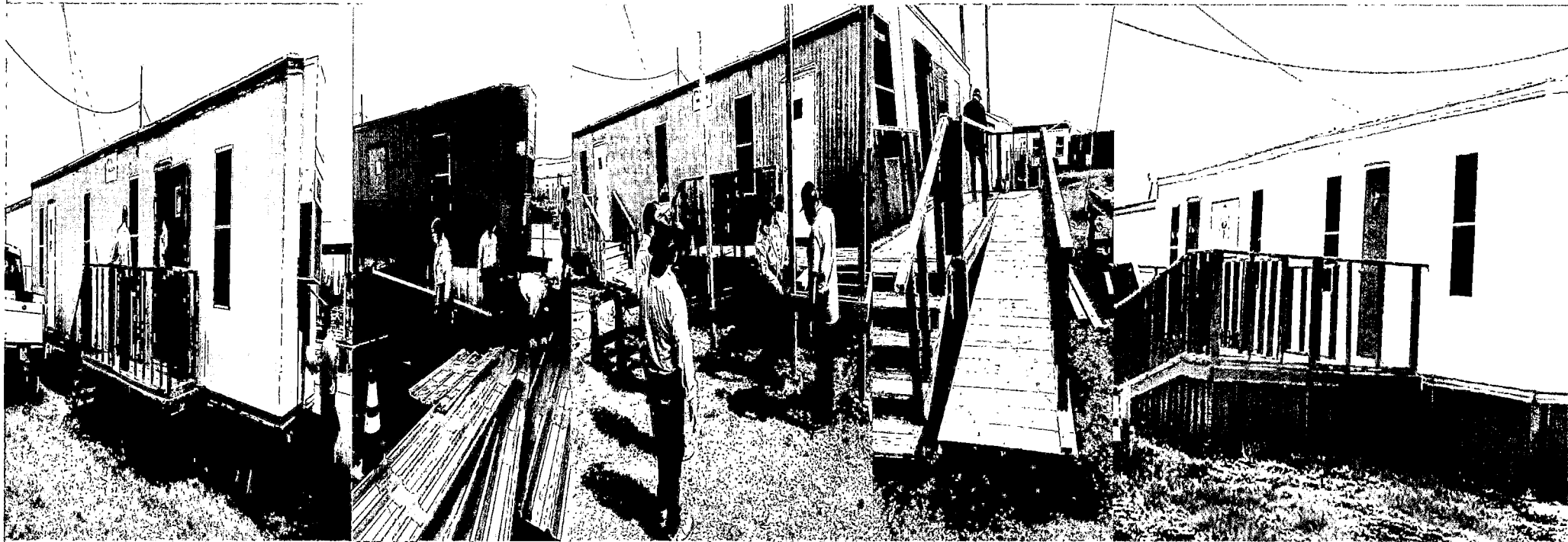
WEBB COUNTY EMPLOYEE MEDICAL & WELLNESS CENTER