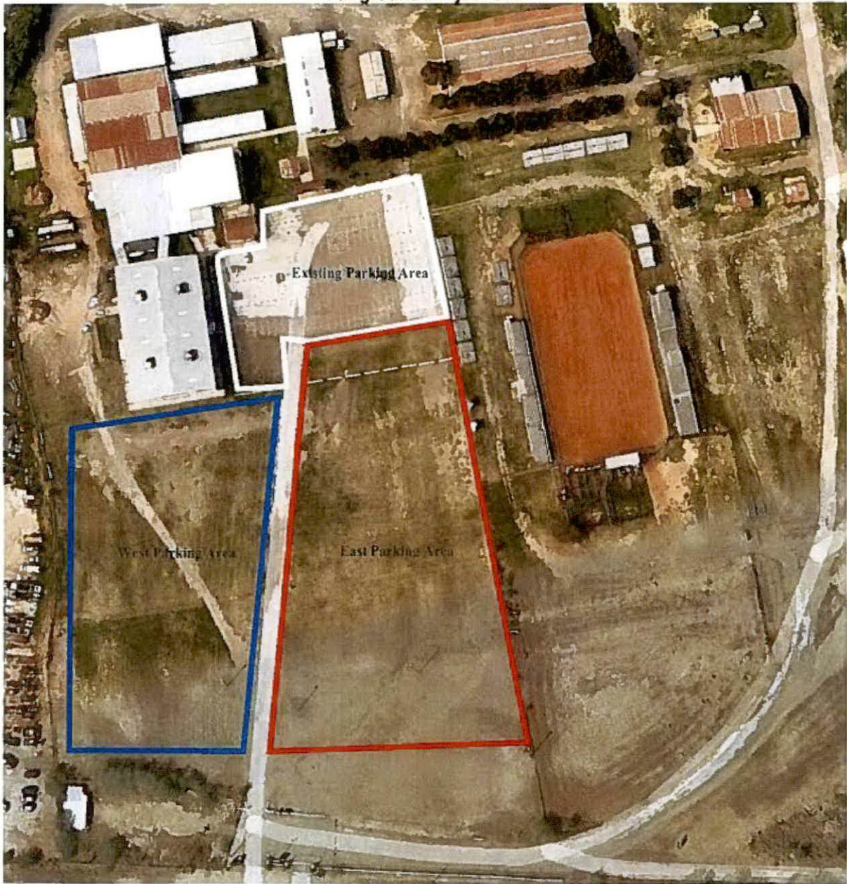
EXHIBIT D Fairground Project Site